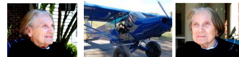
"Adventure is worthwhile in itself." - Amelia Earhart